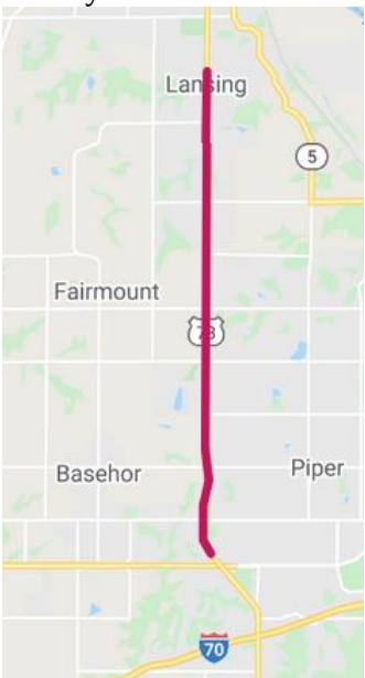
Wyandotte & Leavenworth counties

KDOT urges all motorists to be alert and obey the warning signs when approaching and driving through a highway work zone. To stay aware of all road construction projects across Kansas go to www.kandrive.org or call 5-1-1. Drive safely and always wear your seat belt.