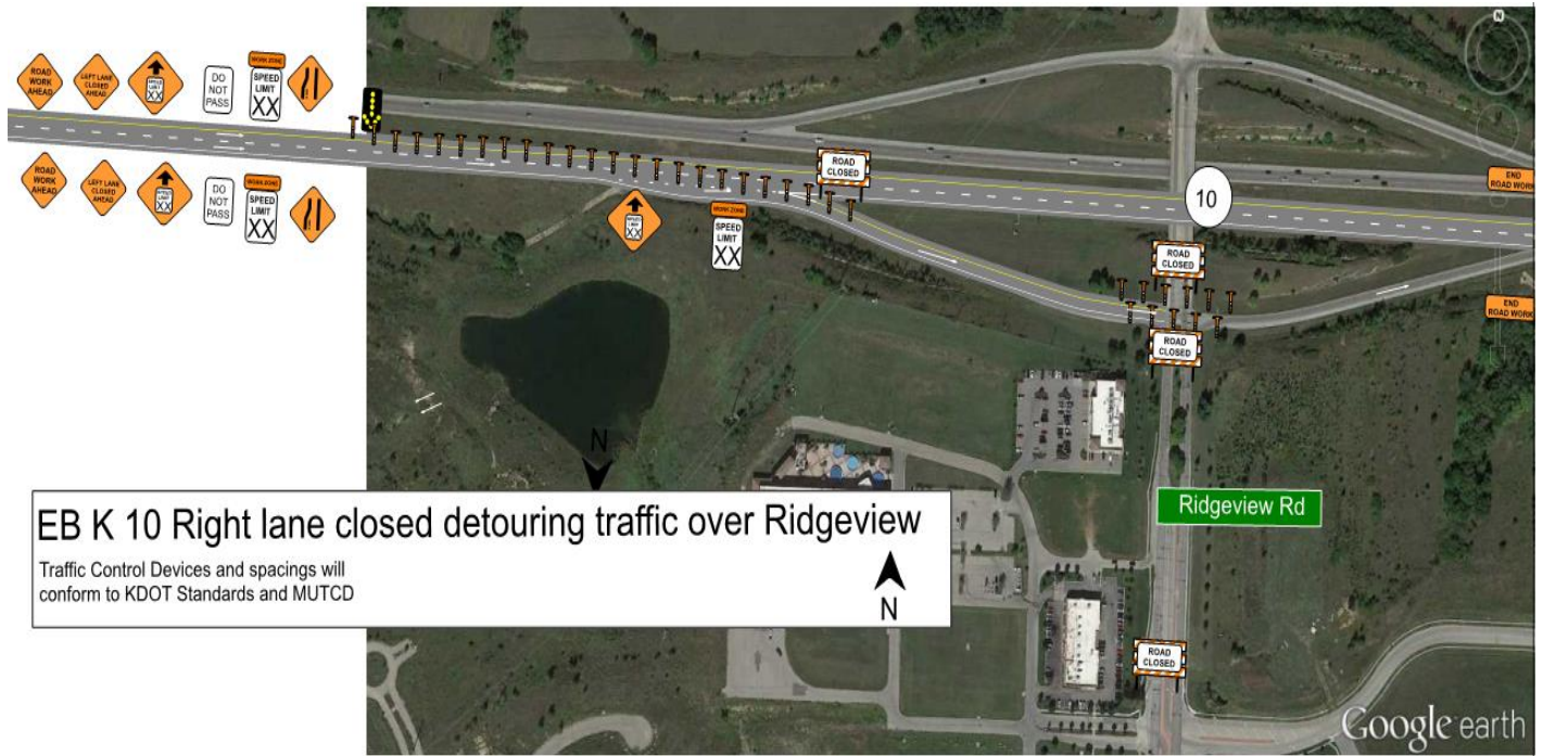
EB K 10 Right lane closed detouring traffic over Ridgeview Traffic Control Devices and spacings will conform to KDOT Standards and MUTCD