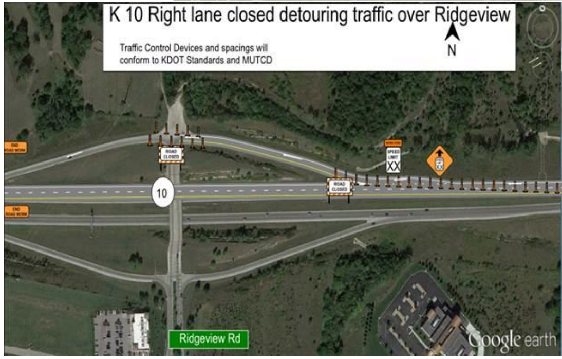
K 10 Right lane closed detouring traffic over Ridgeview Traffic Control Devices and spacings will conform to KDOT Standards and MUTCD