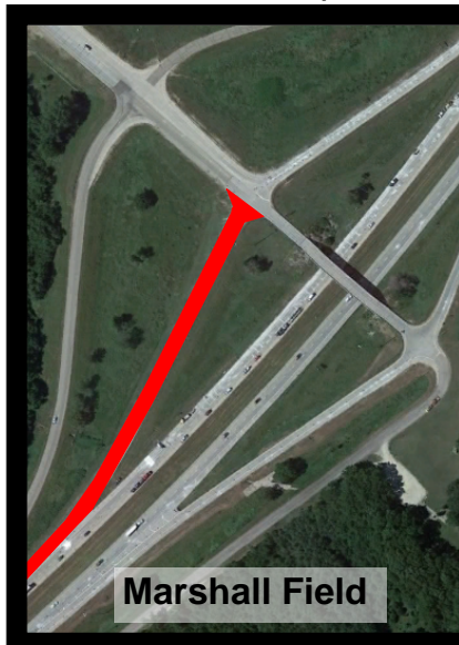
Exit 298/Chestnut WB I70 On Ramp