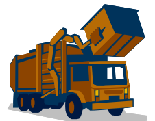
Heavy / Large Truck Summary