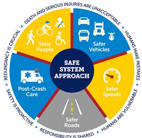
Figure 1: Safe System Approach Principles and Objectives

KDOT developed the VRUSA in alignment with the SSA. To support decision-making, the data analysis aimed to improve understanding of road user behaviors, roadway design, speed, and post-crash care. Future analysis may include the safer vehicle objective; however, vehicle data were not readily available for this VRUSA. KDOT also used the SSA objectives as a framework for stakeholder engagement and the final VRUSA recommendations.