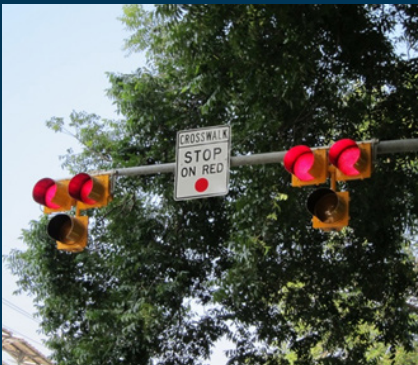
Example of PHBs mounted on a mast arm.

reduction in fatal and serious injury crashes. 4