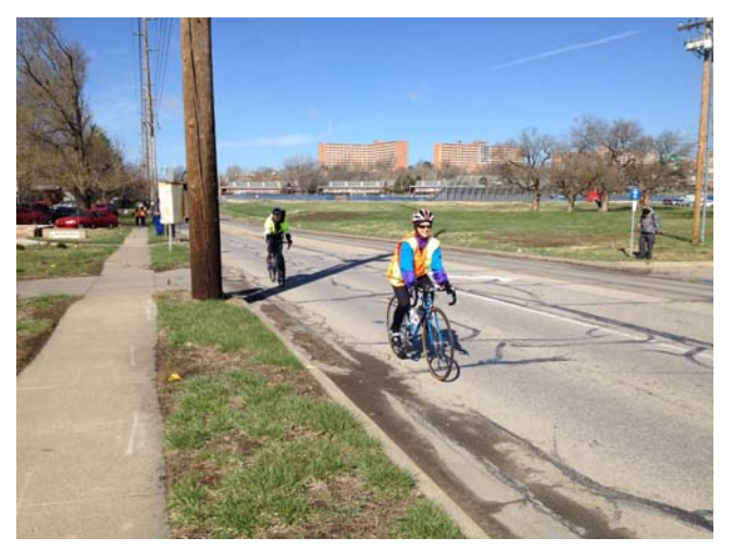
Transit stop at KU dorm near Naismith (Right).