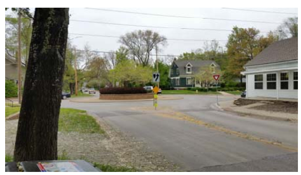
Looking east to Barker Roundabout.

Restrict through commercial traffic east of Massachusetts St.