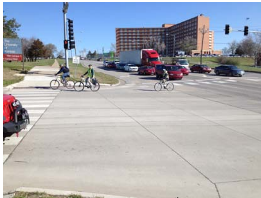
Looking north across 19<sup>th</sup> at Iowa.

<u>Medium Cost</u>: Consider the optional use of a bicycle signal face to control bicycle movements consistent with the MUTCD Interim Approval.