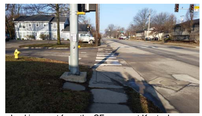
Looking west from the SE corner at Kentucky.

<u>Higher Cost</u>: Reconstruct with appropriate pedestrian accommodations (planned between lowa and Naismith, should include pedestrian facilities on both sides of 19<sup>th</sup> St.