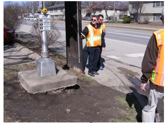
SW Corner of 19<sup>th</sup> & Kentucky

Discussion: Cracking, faulting, and general deterioration of sidewalks are prevalent. Many curb ramps exhibit these conditions in addition to having running slopes and/or cross slopes greater than desirable with no turning space. Many sidewalk sections have no buffer space.