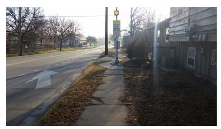
Auxiliary lane termination east of Kentucky

lane with a starting taper near Ohio St. heading eastbound with an ending taper starting at Kentucky terminating west of Vermont St. This encourages weaving and can lead to unsafe vehicle maneuvers. -