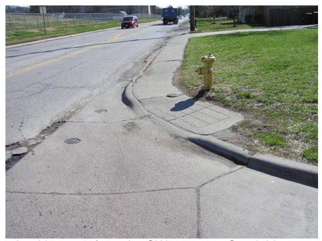
Looking east from the SW corner at Ousdahl.