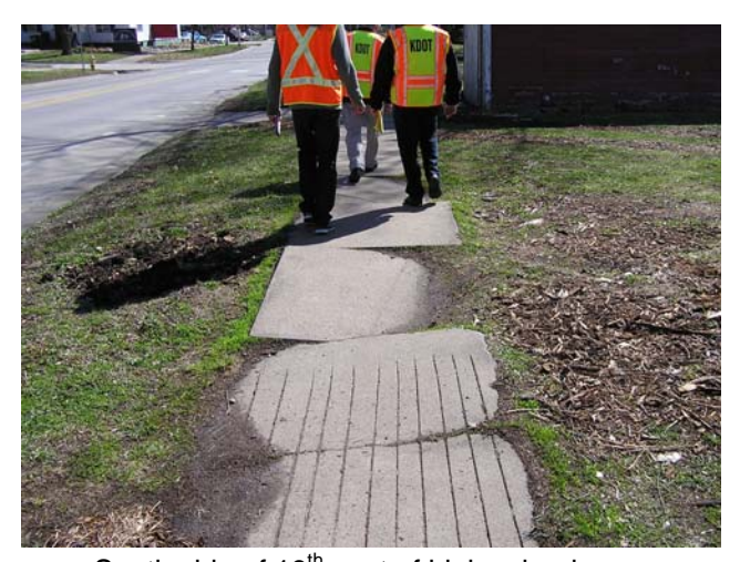
South side of 19<sup>th</sup> east of high school.

Transit: There is a lack of improved bus stop waiting areas along the corridor. Patrons tended to stand on the curb close to traffic.