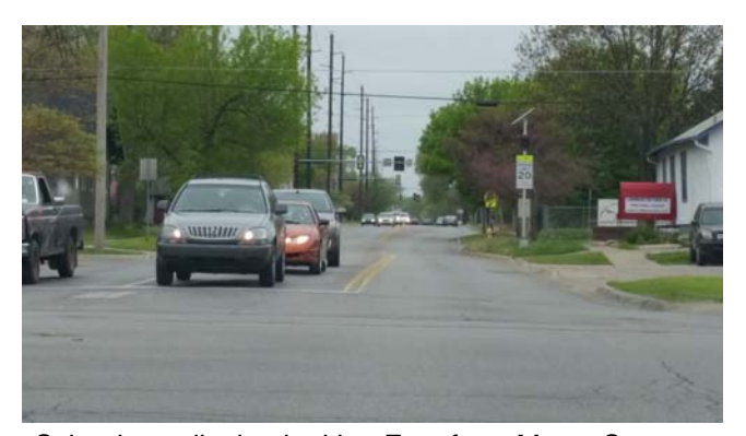
School x-walk sign looking East from Mass. St.