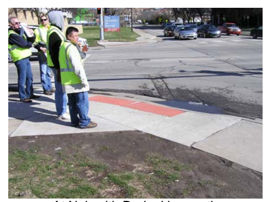
At Naismith Dr. looking north

<u>Lower Cost</u>: Reallocate space in the crosssection to better accommodate a bicyclist and keep a motorist aware of the mixed use.