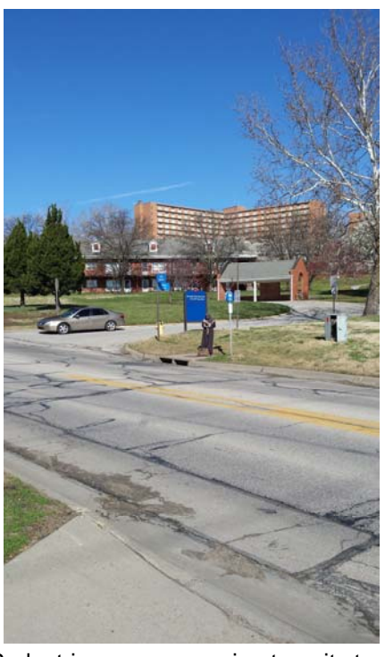
Pedestrian was accessing transit stop.