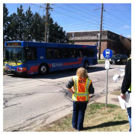
Transit stop at Anna Drive.

Discussion: Concrete pads at bus stops provide patrons room to be a safer distance from the street. A sheltered seating area provides a dedicated space for waiting with greater visibility to a motorist. In addition, greater accessibility to transit services can be achieved with a concrete pad.