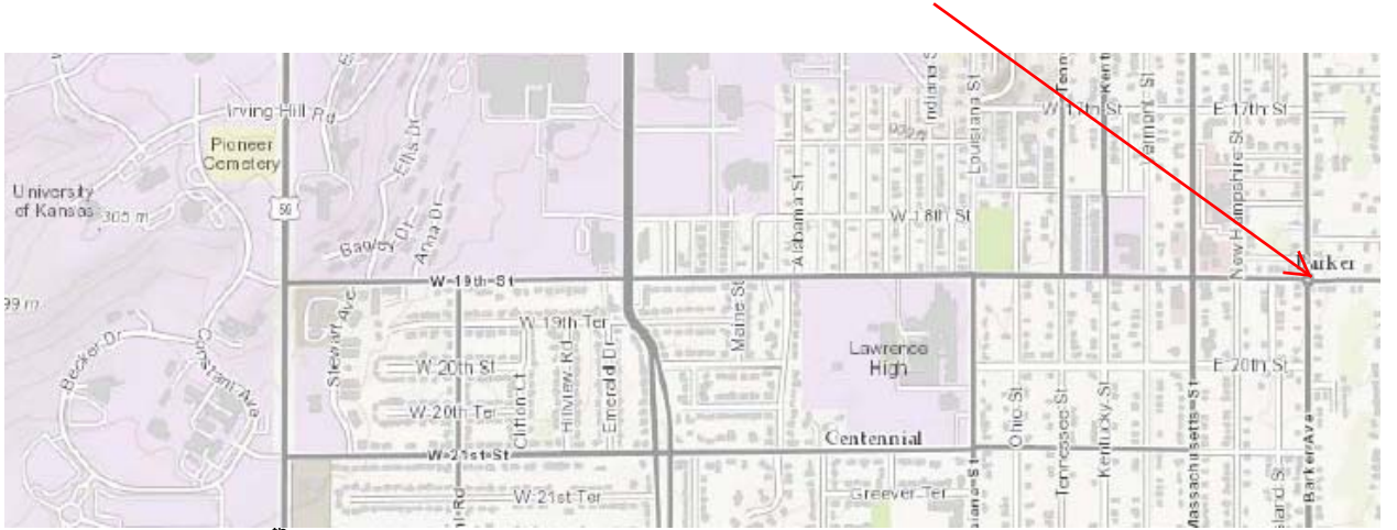
19<sup>th</sup> Street Assessment Corridor - Constant Avenue to Barker Avenue

The City and Lawrence-Douglas County MPO had very good readily available data for the 19<sup>th</sup> St. corridor including bike/pedestrian crash data for the 5 year period including 2009 through 2013. They proved GIS based maps of bike/pedestrian crashes, peak traffic, bike plan, sidewalk defects, sidewalk ramps, bike signs and intersection controls, bus routes/stops, planned Safe Routes to School (SRTS) routes, and street classification. Documentation from the Multimodal Planning Studies covering the 19<sup>th</sup> St. Corridor was provided to the RSA Team. In addition, the University of Kansas provided documentation of future redevelopment related to the 19<sup>th</sup> St. corridor.