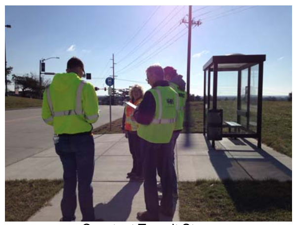
Constant Transit Stop.