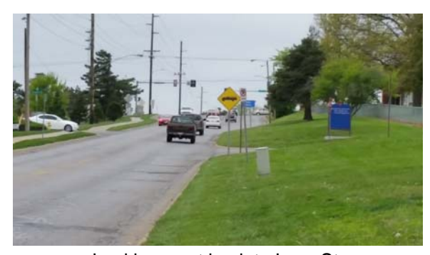
Looking west back to Iowa St.

<u>Lower Cost</u>: Add a west-bound bike climbing lane approaching lowa St. using striping.