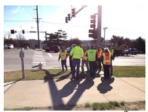
Looking east across Iowa at 19<sup>th</sup>.

Re-grade and add landings for curb ramps. Curb ramps should not exceed 15' but a combination ramp should be considered. This is where perpendicular ramp runs are brought to an intermediate landing. Then the ramp is continued in the direction of the sidewalk (parallel). Provide APS.