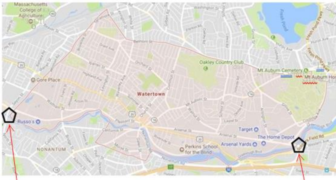
Upstream Site: Farwell Street Bridge over Charles River

Example map and table below—Please fill out map and table on page 26 and adjust as needed.