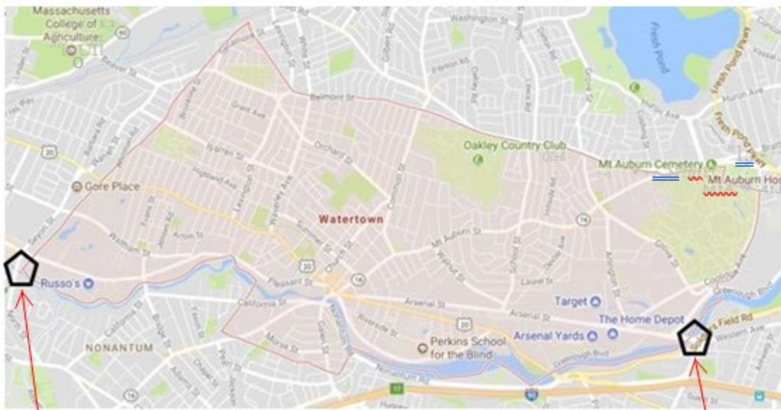
Upstream Site: Farwell Street Bridge over Charles River

Example map and table below—Please fill out map and table on page 26 and adjust as needed.