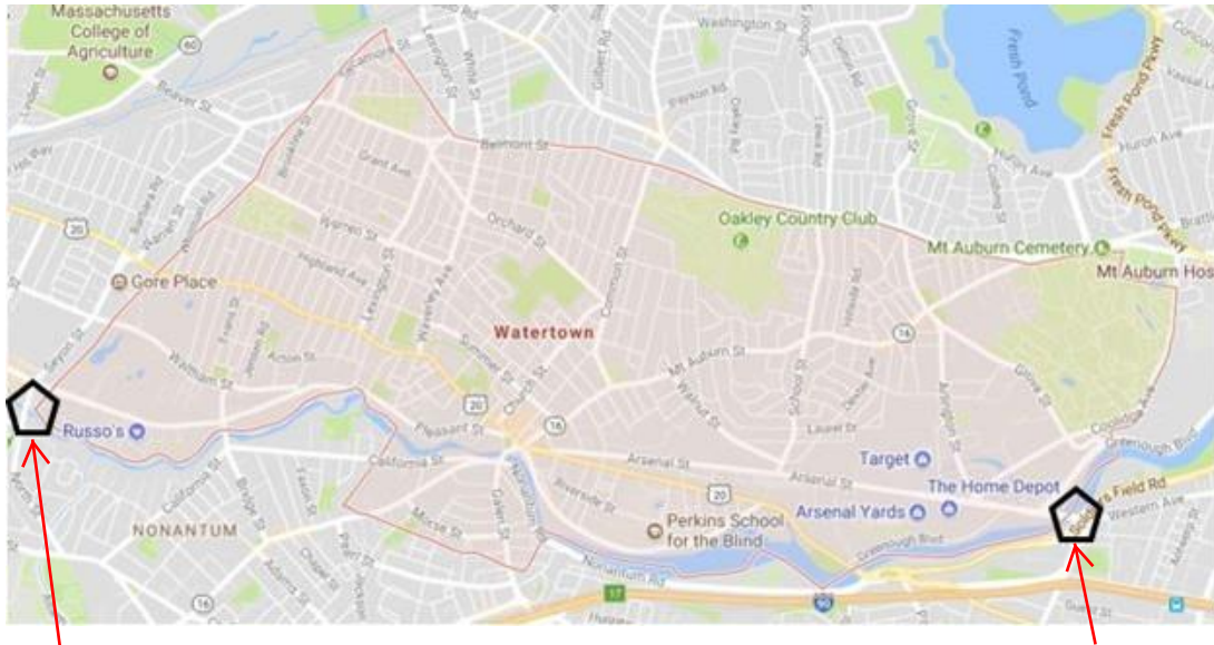
Upstream Site: Farwell Street Bridge over Charles River

Example Map and Table Below - Please fill out map and table on next page and adjust as needed