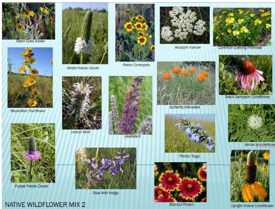
NATIVE WILDFLOWER MIX 2

Upon issuance of the final permit KDOT will evaluate active projects and decide whether to maintain coverage under the 2012 permit or transition to the new permit. Special provisions to address changes will be issued once the permit is finalized by KDHE.