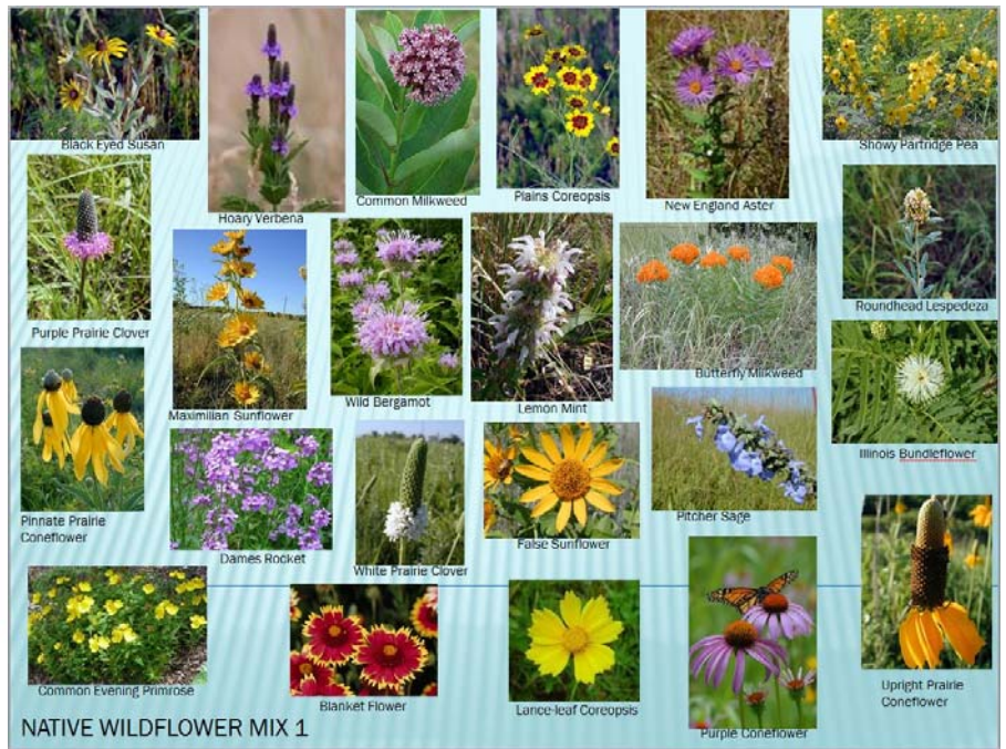
NATIVE WILDFLOWER MIX 1