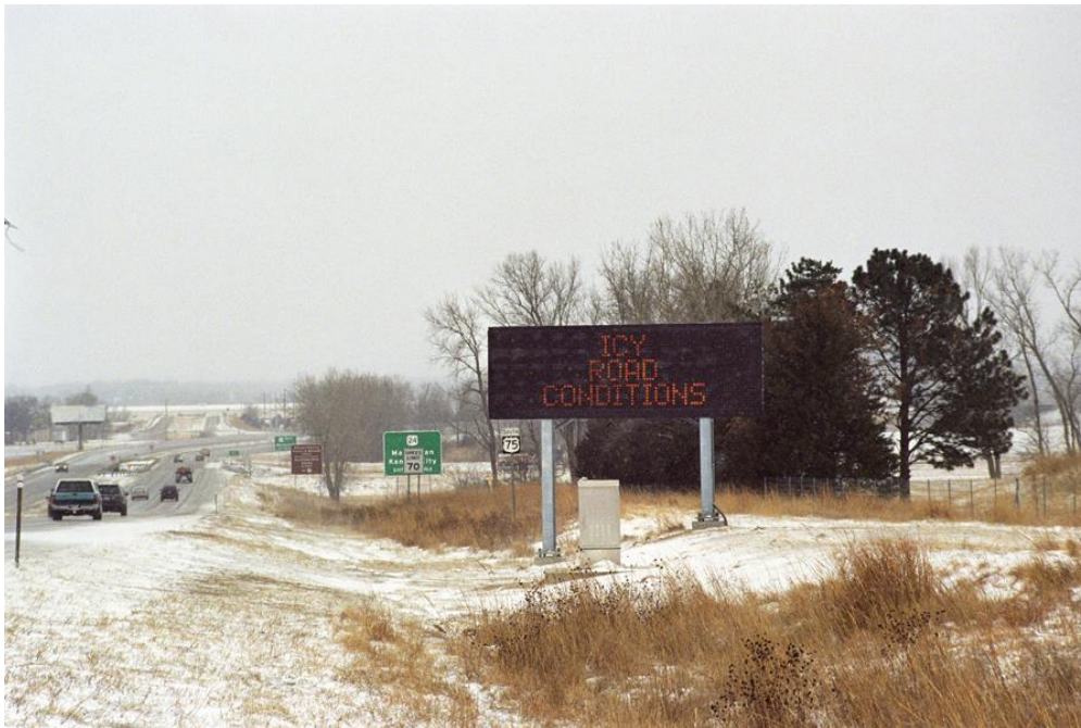
Dynamic message sign on U.S. 75 north of Topeka.

News Contact: Kimberly Qualls, (785) 640-9340 or kqualls@ksdot.org Jerry Haug, (785) 456-2353 or jerryh@ksdot.org