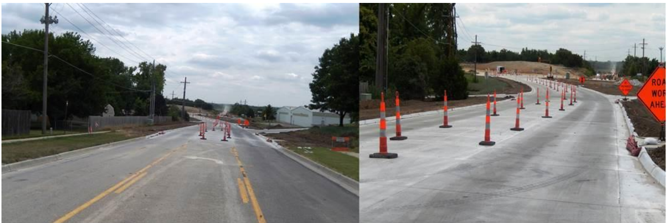
View of Relocated Haskell Avenue from the north end between 27th and 28th Streets looking to the south.

News Contact: Kimberly Qualls, (785) 640-9340 or kqualls@ksdot.org