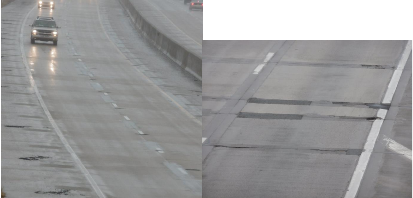
A ‘before look’ at existing I-70 pavement that will be resurfaced via the upcoming overlay work.

7 p.m. and reopening to traffic the following morning at 6 a.m.; and on weekends, 24/7 round the clock, beginning on Saturday at 6 p.m. and reopening to all traffic on Monday at 6 a.m.